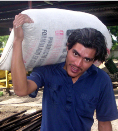
Organic cotton seed ready to be planted